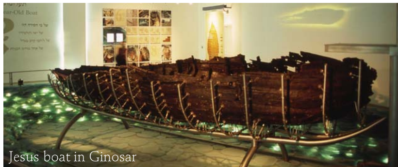
Jesus boat in Ginosar